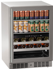
MRBD224-SG31A Stainless Steel Frame Glass