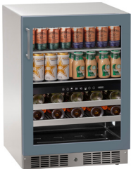
MRBD224-IG31A Panel Ready Frame Glass