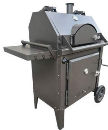
Ultimate Charcoal Smoker & Pizza Oven Combo Grill Cart – All-in-One | STARBBQ-34SMK