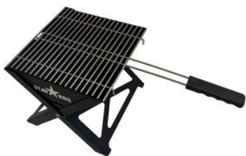
Folding A-Frame Camper Charcoal Grill – Portable and Compact | StarBBQ-AFCG