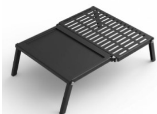
Heavy-Duty Steel Fold-Out Camper Griller Griddle Combo | STARBBQ-FUFP

StarBBQ™ offers versatile options for campfire, camping, and backyard adventures, including smokeless fire pits, portable charcoal grills, and innovative grill inserts—all built with durable materials for reliable performance.