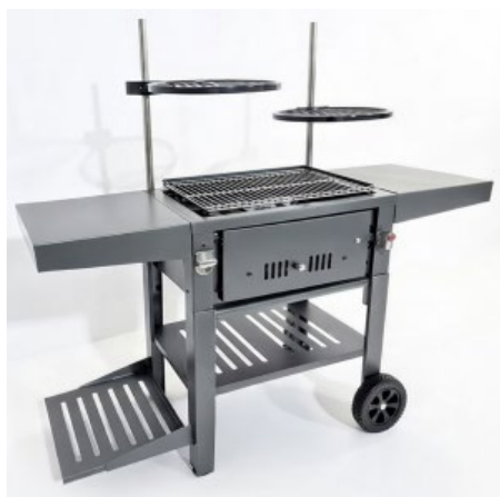
24" Charcoal Griller Base with Unlimited Versatility and Upgrades, like the Cart, Santa Maria, Hood, Post-Griller | STARBBQ-24CHBS