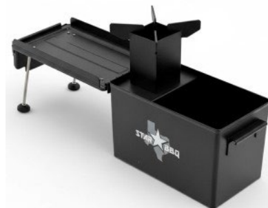
Rocket Stove Camper Box – Military-Grade Ammo Can Portable Charcoal Stove | STARBBQ-RSBOX