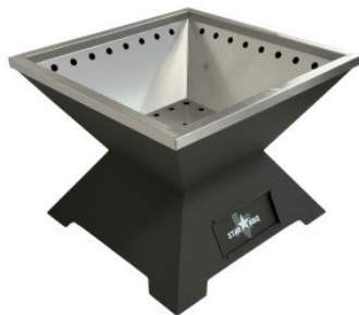
24" Smokeless Fire Pit Base Platform – Ultimate Versatile Outdoor Cooking Hub | STARBBQ-24FPBS