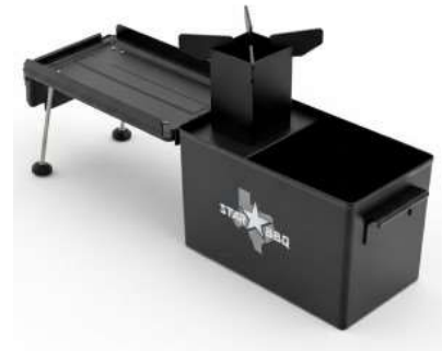
Rocket Stove Camper Box – Military-Grade Ammo Can Portable Charcoal Stove | STARBBQ-FUFP