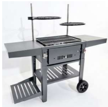
24" Charcoal Griller Base with Unlimited Versatility and Upgrades, like the Cart, Santa Maria, Hood, Post-Griller | STARBBQ-24chbs