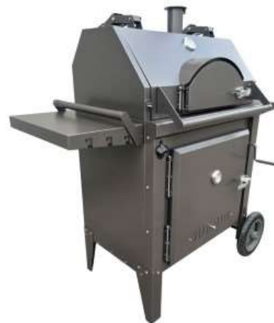
Ultimate Charcoal Smoker & Pizza Oven Combo Grill Cart – All-in-One | STARBBQ-34SMK