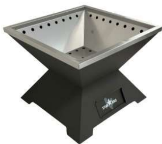
24" Smokeless Fire Pit Base Platform – Ultimate Versatile Outdoor Cooking Hub | STARBBQ-24FPBS