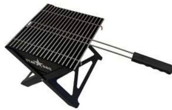
Folding A-Frame Camper Charcoal Grill – Portable and Compact | StarBBQ-AFCG