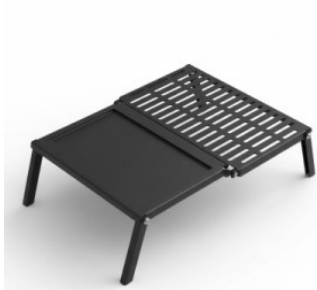
Heavy-Duty Steel Fold-Out Camper Griller Griddle Combo | STARBBQ-FUFP

StarBBQ™ offers versatile options for campfire, camping, and backyard adventures, including smokeless fire pits, portable charcoal grills, and innovative grill inserts—all built with durable materials for reliable performance.