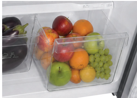
Humidity Controlled Crisper Drawers

Comes with a crisper drawer that maintains ideal humidity to preserve veggies, fruits and deli foods for extended freshness.