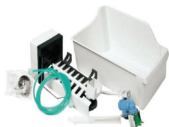
Verona VEIM0202W Optional Ice Maker Kit