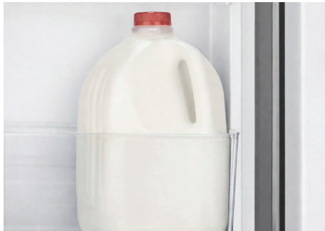
Gallon Door Bin

Large door bins designed to hold gallon sized containers, providing you with convenient access to your milk.