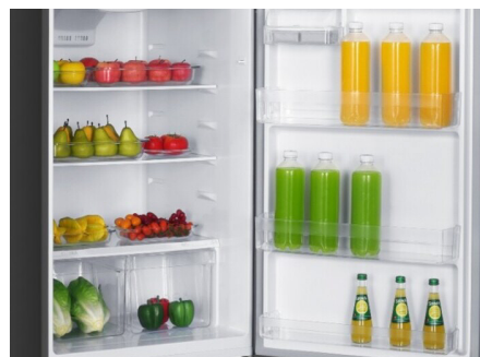
Customizable Storage System

Equipped with 4 full-width adjustable glass shelves and 6 variable-size door racks, enabling flexible fridge storage layout to neatly arrange groceries of varying sizes and maximize interior space utilization.