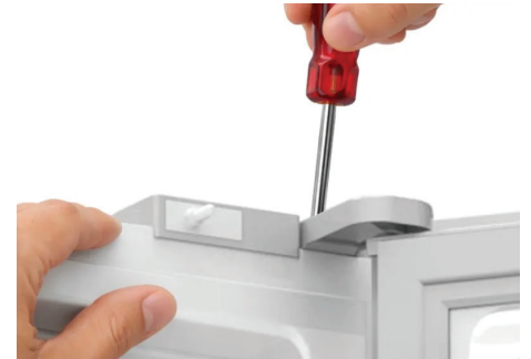
Reversible Door Hinge

Comes right hinge but pre-drilled holes allow for reversible door installation to suit your opening orientation.