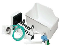
Verona VEIM0202W Optional Ice Maker Kit